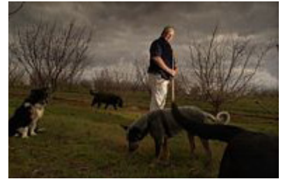
The Wine and Truffle Co.

Comfortable clothes (good shoes if your climbing the diamond tree) and a camera