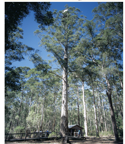
Diamond Tree Lookout