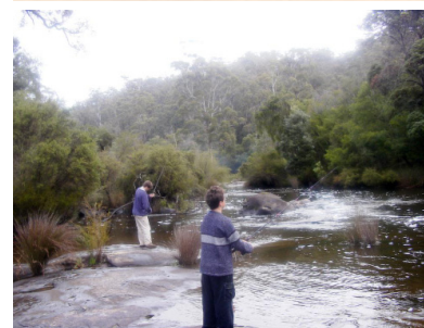
Fishing at Moons Crossing