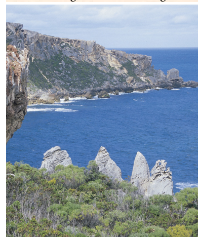
The lookout at Salmon Beach